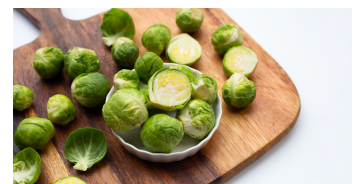
Brussel Sprouts 1 cup (90 g) = 3 g protein