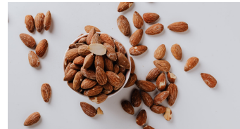
Almonds 1/4 cup (36 g) = 8 g protein