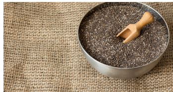
Organic Chia Seeds