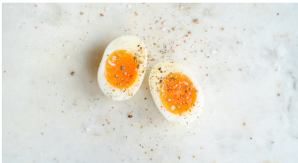
Eggs 1 large egg = 6 g protein 1 cup (240 g) egg whites = 27 g protein