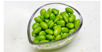
Edamame 1 cup (120 g) = 12 g protein