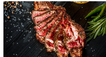
Lean Cooked Steak 3 oz (85 g) = 26 g protein