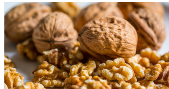
Organic Raw Walnuts