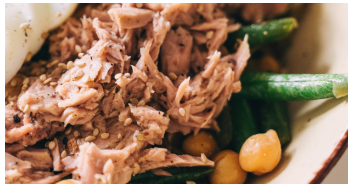
Cooked Tuna 3 oz (85 g) = 22 g protein