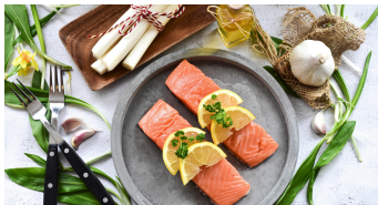
Wild Caught Salmon

Here are some examples of quality omega-3 sources: