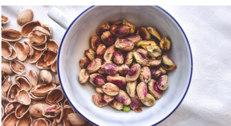
Pistachio 1/4 cup (30 g) = 6 g protein