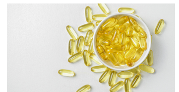
Cod Liver Oil (speak with your provider about brands)