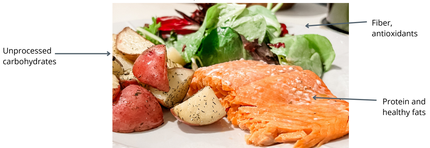
Example of a Balance Plate

To improve insulin sensitivity, meals should be balanced with clean protein, healthy fats, and fiber. Healthy fiber is abundant in whole foods such as vegetables, fruit, beans, legumes, and minimally processed grains (such as quinoa or barley).