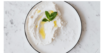
Low Fat Cottage Cheese 1 cup (226 g) = 28 g protein