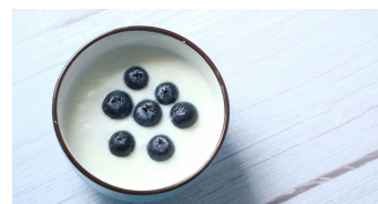
Low Fat Greek Yogurt 1 cup (240 g) = 28 g protein