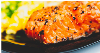
Cooked Salmon 3 oz (85 g) = 22 g protein