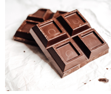
Milk chocolate for dark chocolate