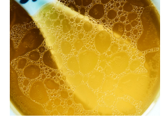
Chicken or beef broth for organic bone broth