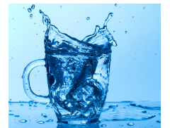
Plastic bottled water for filtered water in a glass or stainless steel container