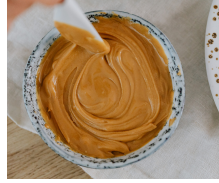
Peanut butter w/sugar and palm oil for natural almond butter