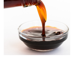
Soy sauce for coconut aminos