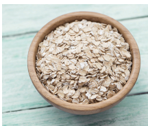
Flavored instant oatmeal for plain organic oatmeal