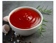
Ketchup with corn syrup for natural unsweetened ketchup