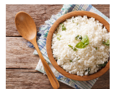
White rice for cauliflower rice or quinoa (can buy frozen)