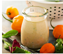
Store bought salad dressings for homemade salad dressings