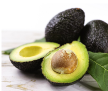
Mayonnaise for avocado or avocado oil mayo