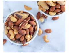
Roasted mixed nuts for raw mixed nuts