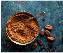
Premade hot cocoa mix for raw cacao powder with coconut milk