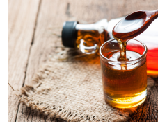
Fake maple syrup for 100% pure maple syrup