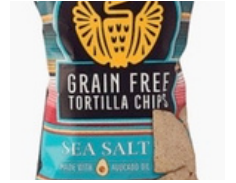
Highly processed corn chips for Siete grain free chips