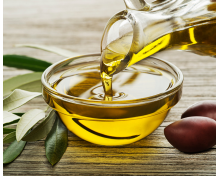
Canola or vegetable oil for olive or coconut oil