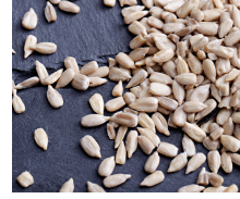
Croutons for nuts or seeds