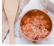
Table salt for pink Himalayan salt