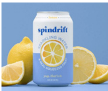
Soda for sparkling water