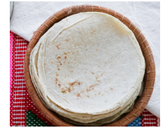
Flour tortillas for cassava tortillas or coconut wraps