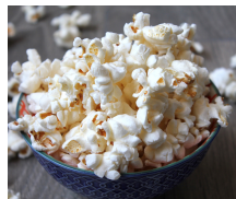
Potato chips for air popped popcorn