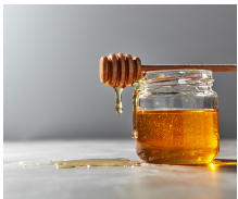
Sugar or artificial sweetener for honey