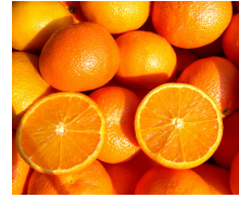
Fruit juices for whole fruit