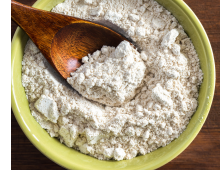
White flour for almond flour or oat flour