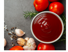
Pasta sauce w/added sugars for sugar-free pasta sauce