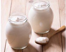
Low fat flavored yogurt for plain Greek yogurt