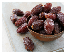
Cookies/desert for dates