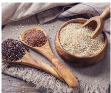
Wheat pasta for quinoa or chickpea pasta