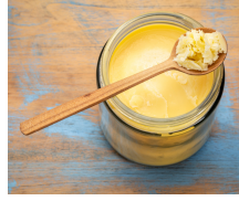
Margarine for grass fed ghee