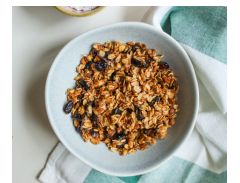
Cereal for paleo granola or organic oatmeal