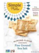
Highly processed crackers for Simple Mills crackers